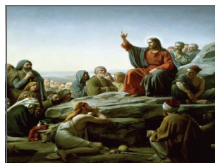
Teaching Ministry of Jesus