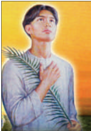
“From his childhood, Pedro Calungsod declared himself unwaveringly for Christ and responded generously to his call.” (Pope John Paul II)